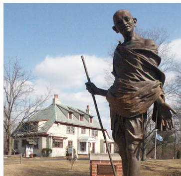
Peace Abbey in Sherborn, MA

On Saturday, October 3, a Stone Walk ( http://www.stonewalk.org/ ) will be held between Natick MA and the Peace Abbey,